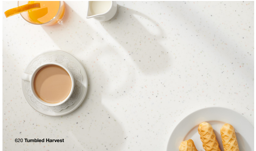
620 Tumbled Harvest

COLOR # _____ COLOR NAME _____ SIZE _____ THICKNESS _____