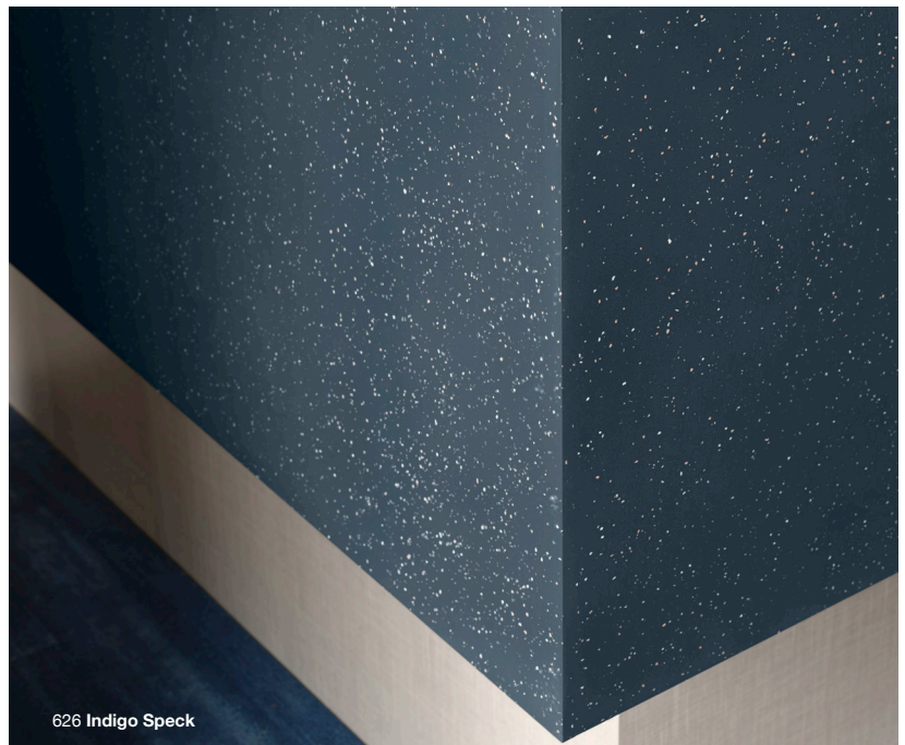
626 Indigo Speck